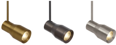
aged brass antique bronze satin nickel