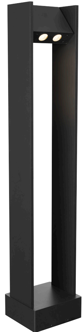
ZUR BOLLARD shown in black